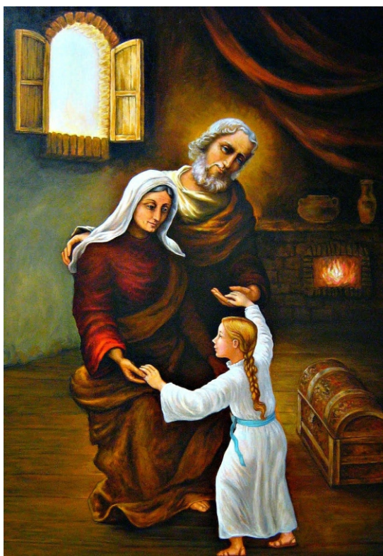
Blessed Virgin Mary along with St. Anne & St. Joaquim